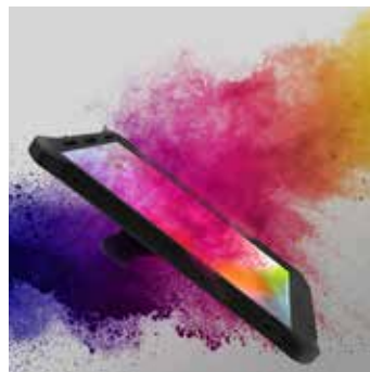
Dustproof Fully enclosed protecting buttons and ports