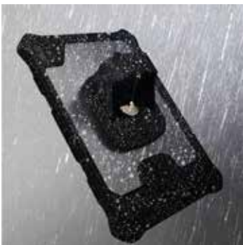
Water Protection From accidental splashes of liquid

Ensuring a businesses tablet investment is protected every step of the way while keeping employees connected is at the core of the aXtion Volt line. Features include the detailed below.