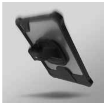
Drop Proof MIL-STD-810H Certified